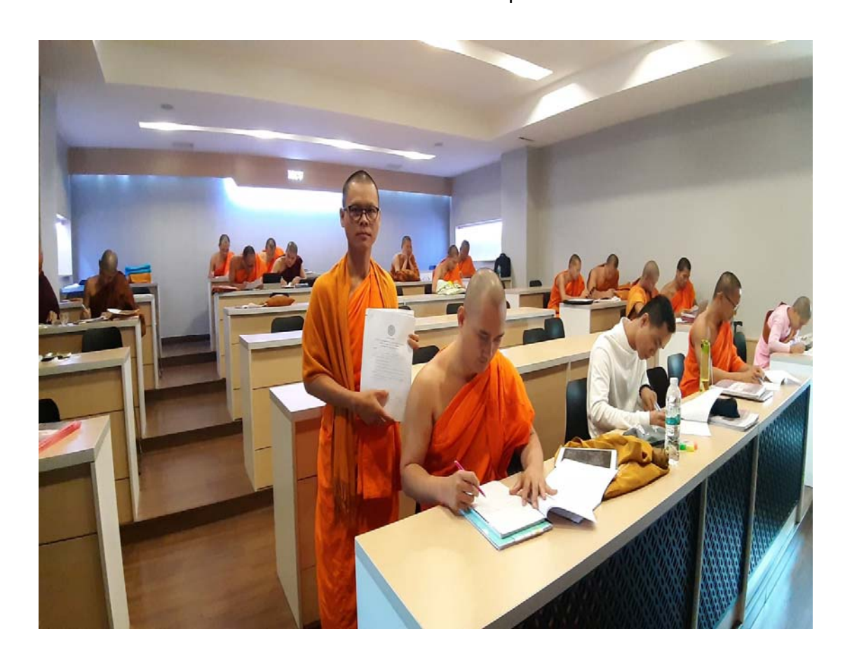
Appendix (B) Picture of activities collection questionnaires